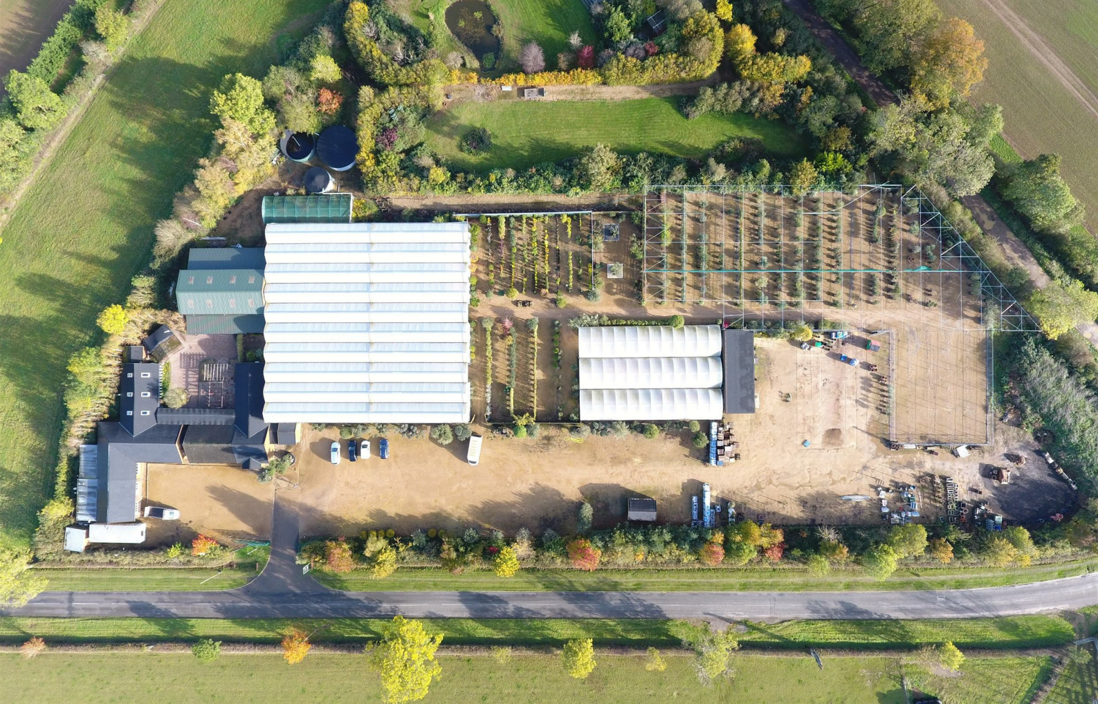
Garden Centre and Cafe site - Oundle Road, Polebrook, Oundle PE8 5LQ